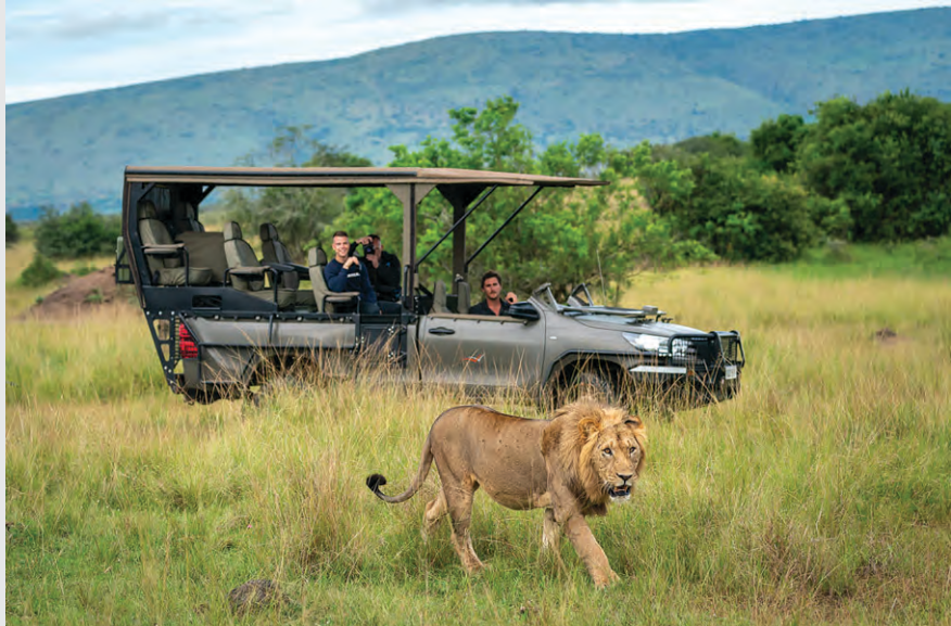
Magashi Camp (BLD) includes meals, selected drinks, and laundry