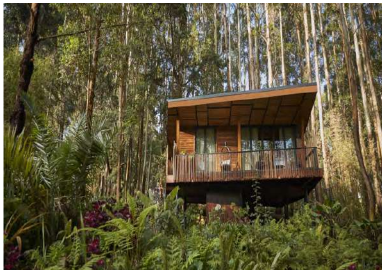
One & Only Gorillas Nest (BLD) includes meals, selected drinks, and laundry